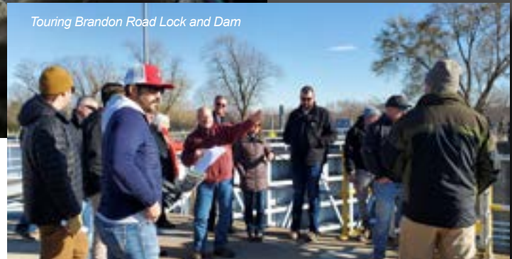
Touring Brandon Road Lock and Dam

Following the presentations at the college, the group traveled to Brandon Road Lock and Dam to get a firsthand look at lock operations and the areas where construction is planned for the project.