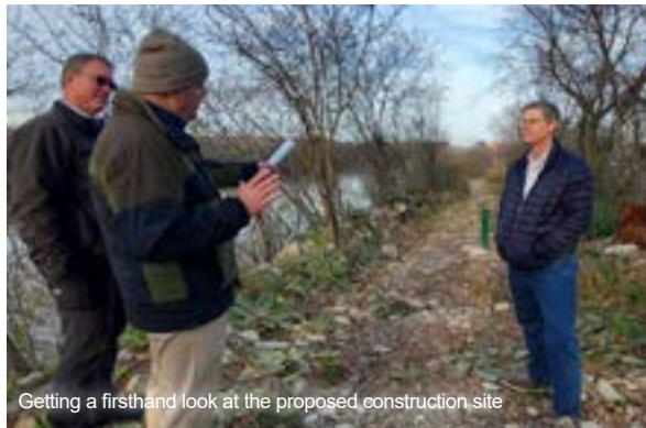
Getting a firsthand look at the proposed construction site

Construction of the entire project is expected to take six to eight years but operation of the first increment could be operational as soon as 2025. Coordination and communication will be key in keeping the project's timeline on track.