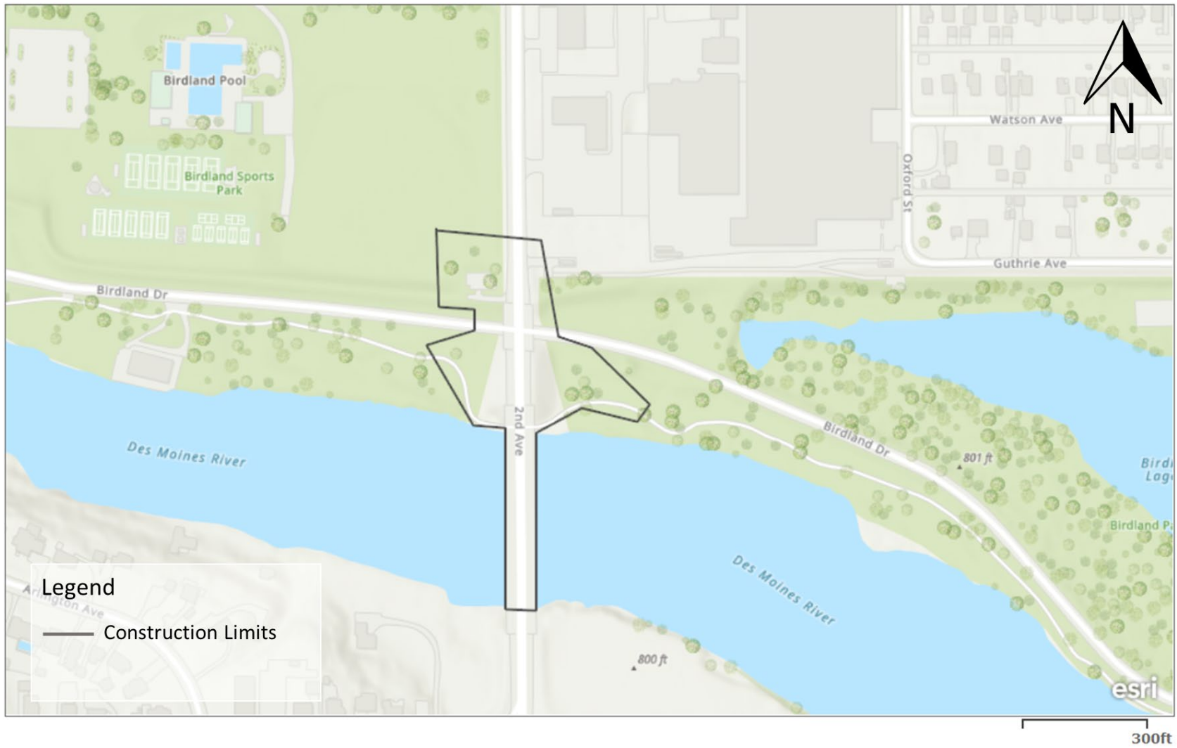
Figure 2. Project Site Map