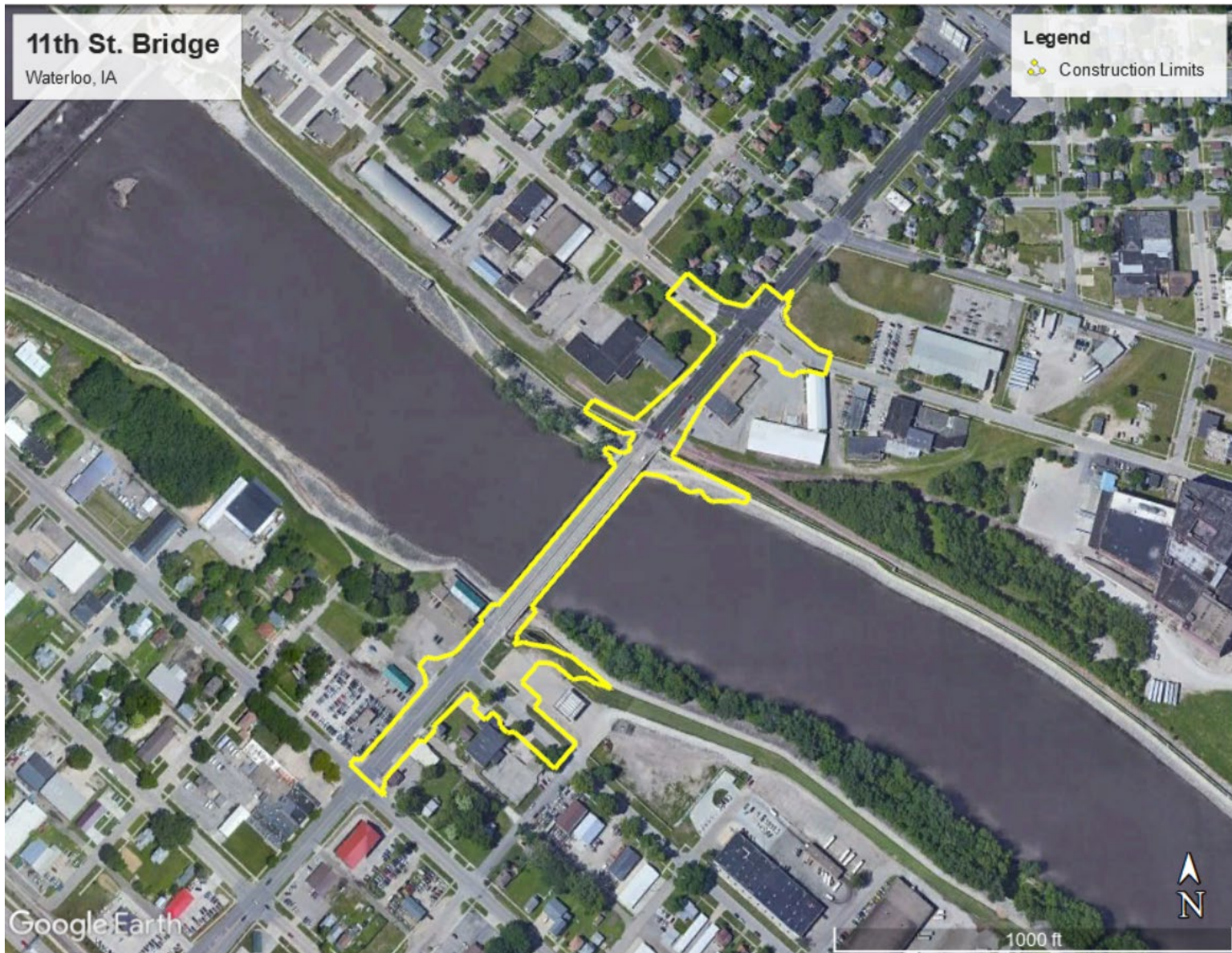
Figure 2. 11 th St Bridge Project Area Construction Limits