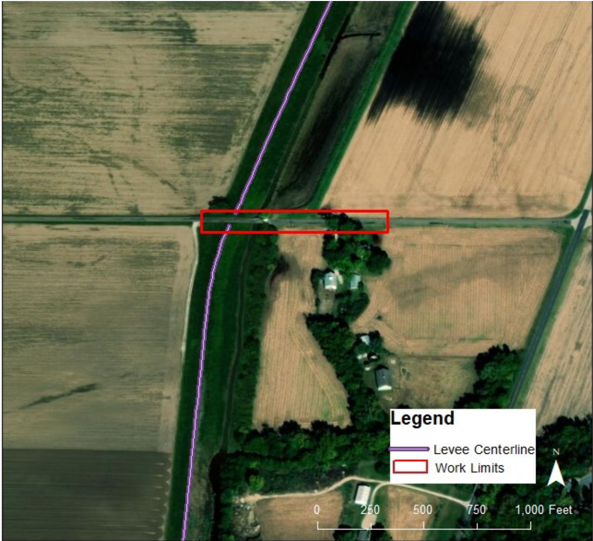
Figure 2 of 2 Project Site Map.