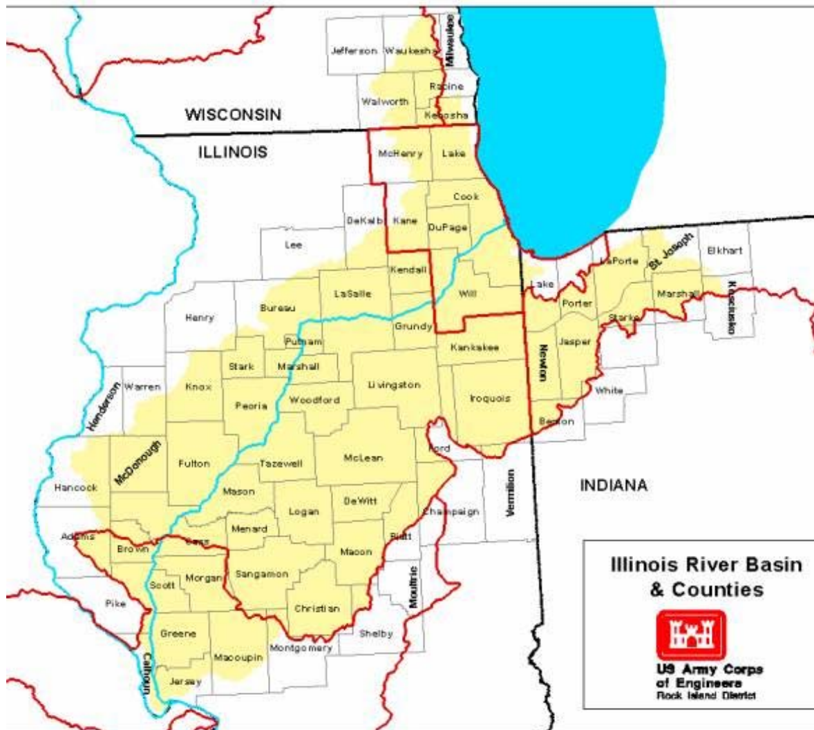
Figure F-1. Map of the Illinois Basin (shaded in yellow)