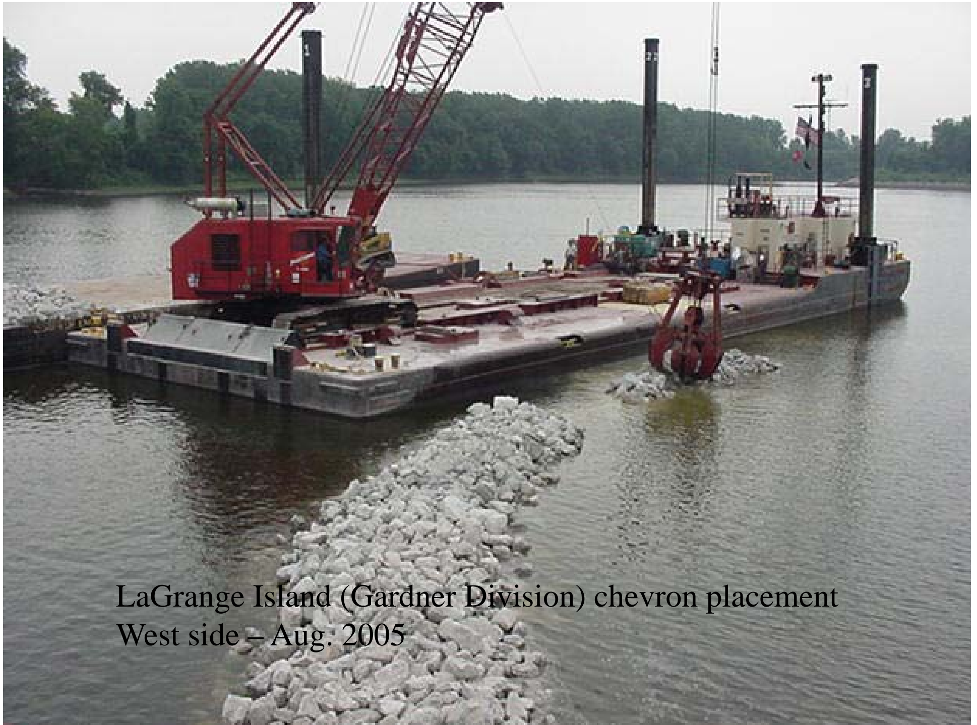
LaGrange Island (Gardner Division) chevron placement West side – Aug. 2005