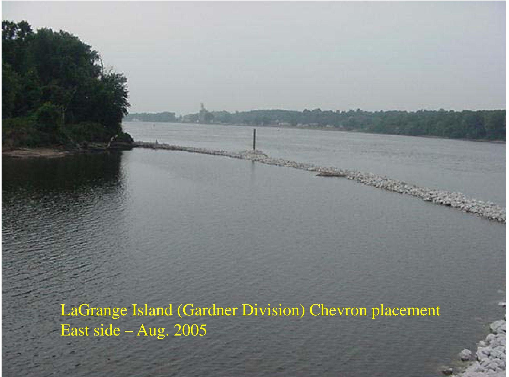
LaGrange Island (Gardner Division) Chevron placement East side - Aug. 2005