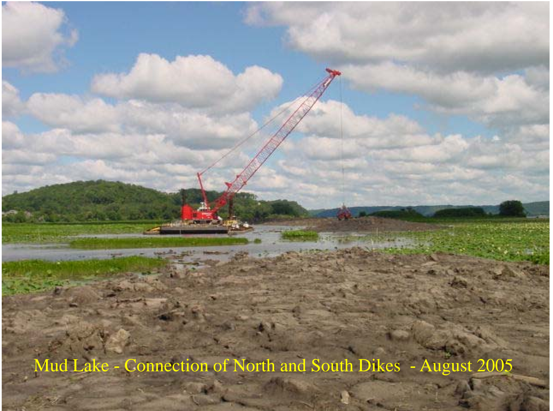
Mud Lake - Connection of North and South Dikes - August 2005