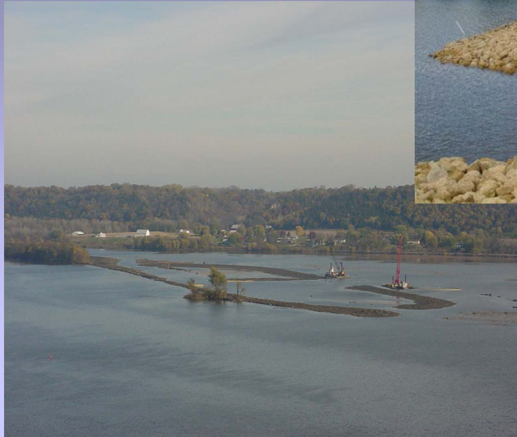
Dredged Material Placement Site Construction