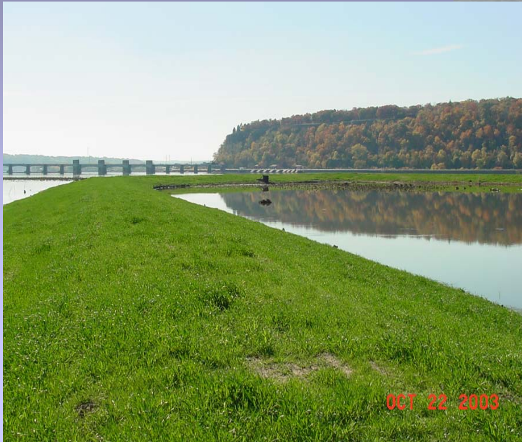
Deflection Embankment/ Dredged Material Placement Site