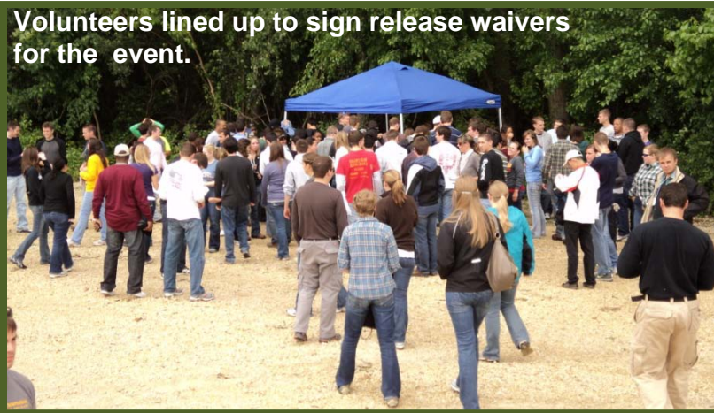
Volunteers lined up to sign release waivers for the event.

Each year summer in June, John Deere hosts 250 summer interns for two days at their headquarters in Moline, IL to give students the opportunity to learn about John Deere's history and its future.