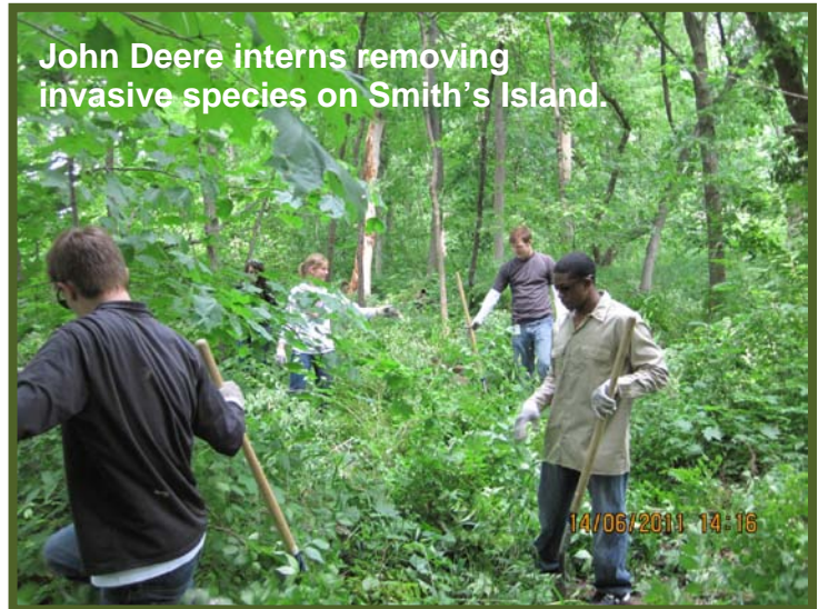
John Deere interns removing invasive species on Smith's Island.

The other 78 interns walked to Smith's Island located at Locks and Dam 14 where they pulled the invasive species amur honeysuckle, then filled in by planting shade tolerant species that included: silky dogwood, eastern redbud, pecan, sycamore, white oak, bur oak, red oak and hackberry.