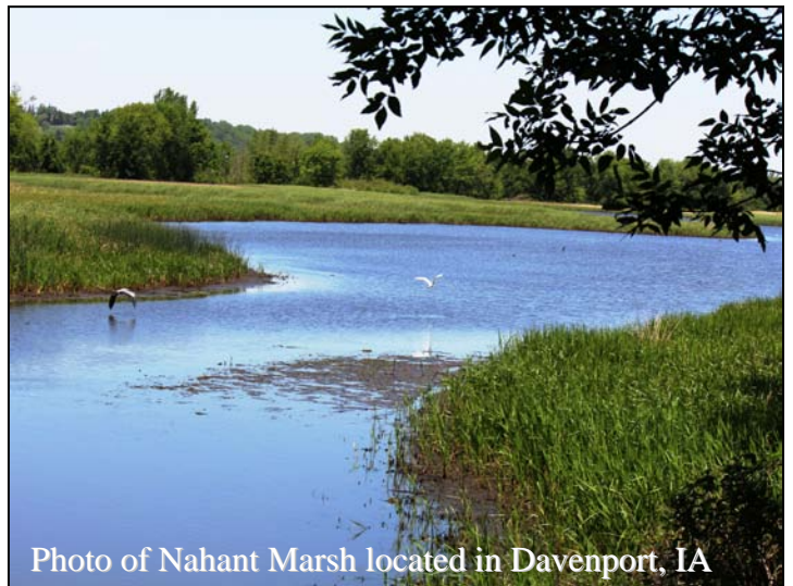
Photo of Nahant Marsh located in Davenport, IA

Fisherman’s Corner Campground is located just on Highway 84 just north of Hampton, IL. The campground offers 56 campsites, electrical hookups, shower and restroom facilities, drinking water, a dump station, and playground.