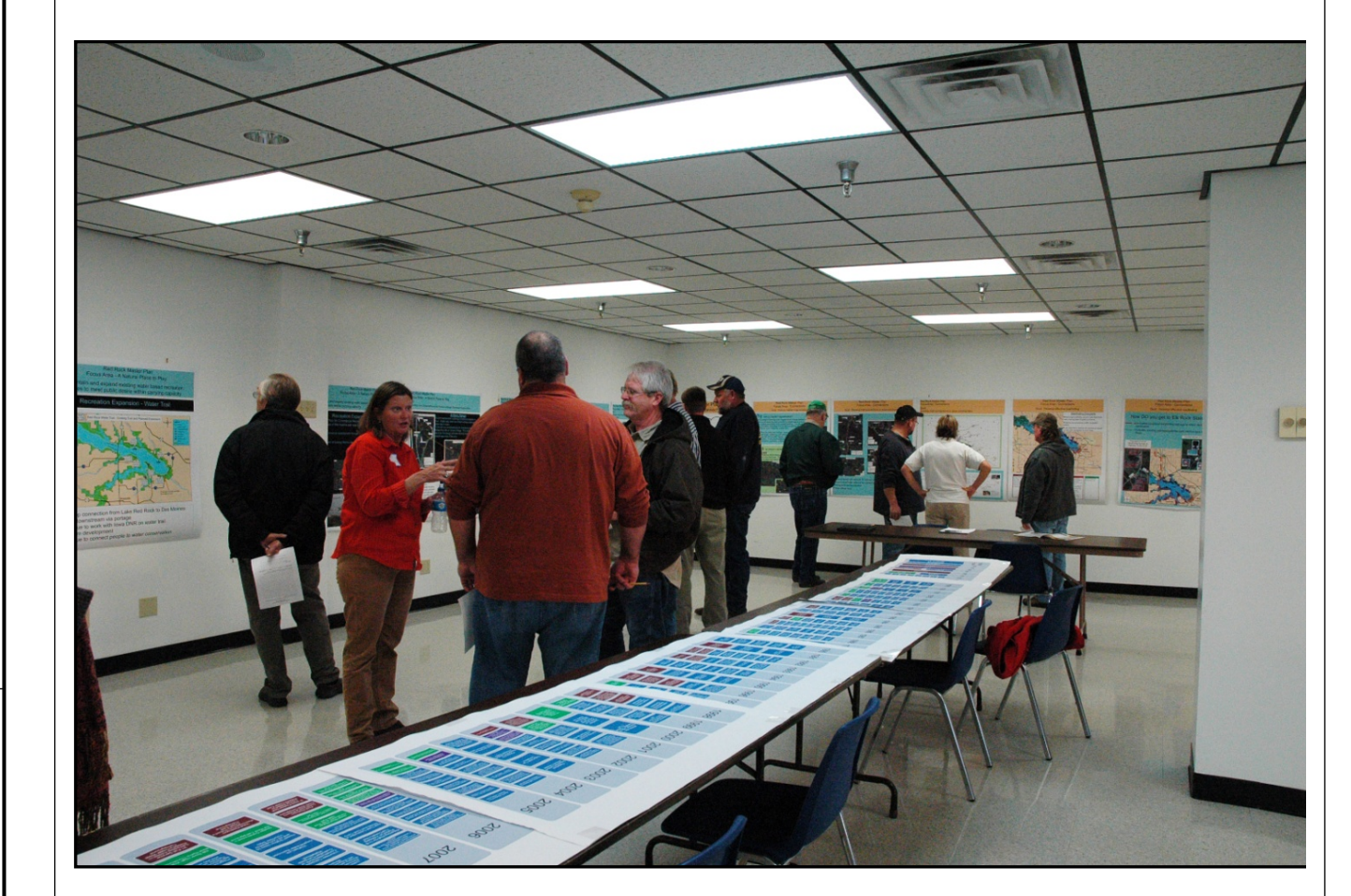
Master Plan Public Meeting

All comments received during the final comment period along with Corps responses can be found in their entirety in Appendix B, Agency and Public Coordination .