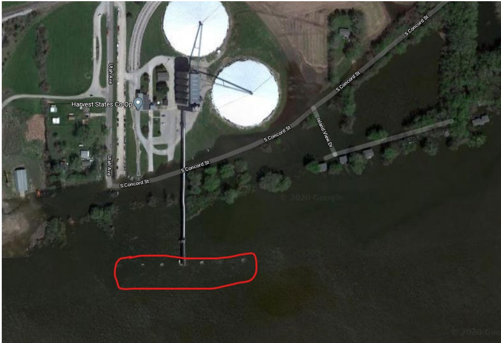
CEMVR-RD-W 2020-1469 Upper Dredge Location Map Drawing 2 of 3