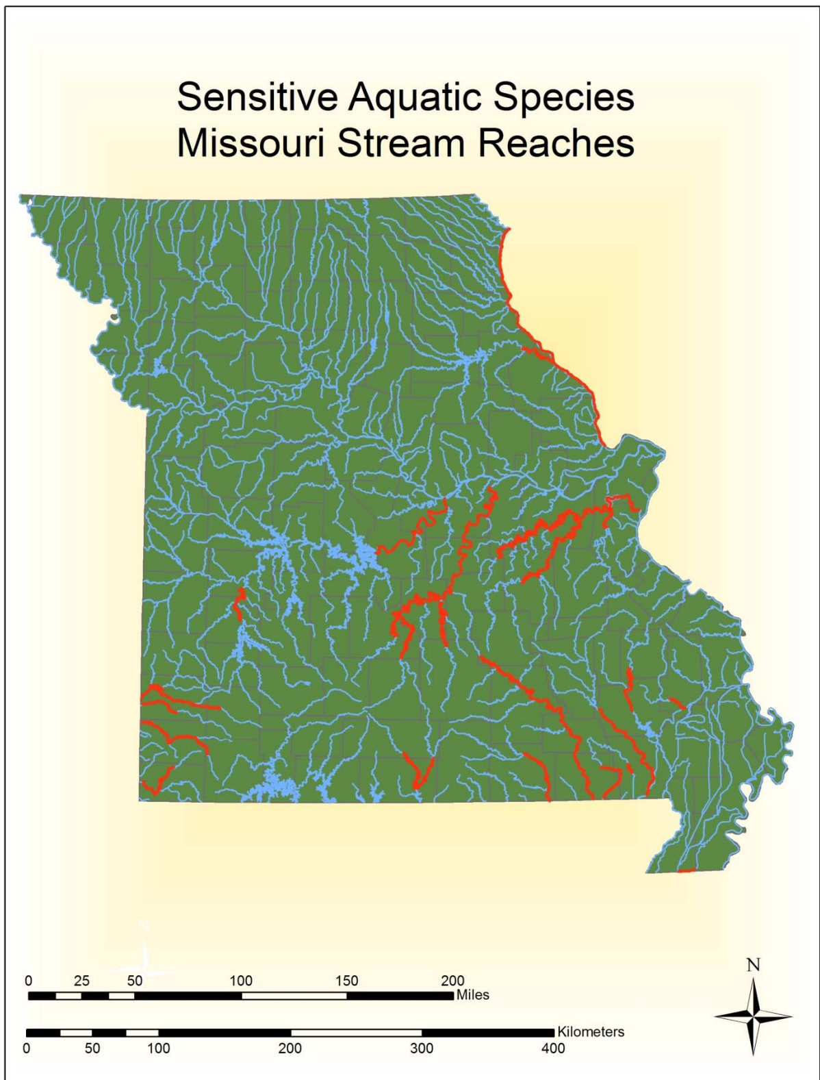
Figure 1. Location of affected streams within Missouri.