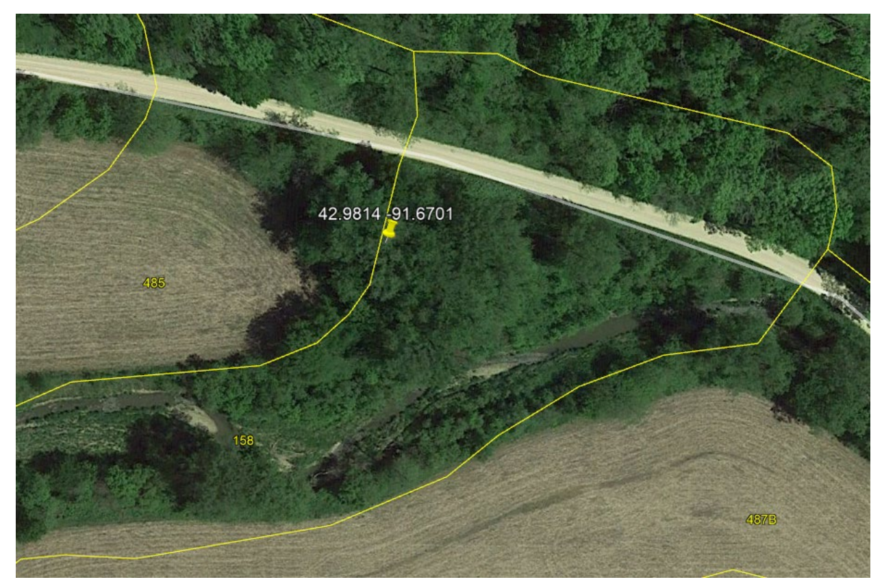
Neither soil series are hydric soils.